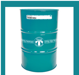
54-gallon drum SKU: SOL/54 UPC-12: 641238008408