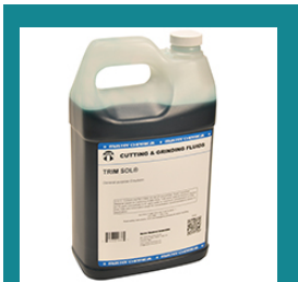
1-gallon jug SKU: SOL/1 UPC-12: 641238008361