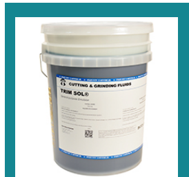
5-gallon pail SKU: SOL/5 UPC-12: 641238008392