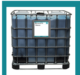
270-gallon tote SKU: SOL/NR270P UPC-12: 641238034216

TRIM SOL ® | ©1964-2020 Master Fluid Solutions ® | 2020-04-26